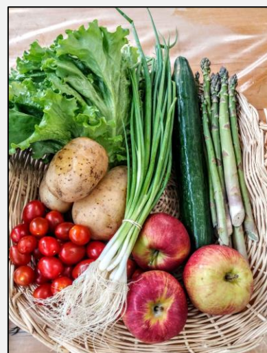
Example of a "Solo" basket at $20/week

With local fruits and vegetables available early June 2023